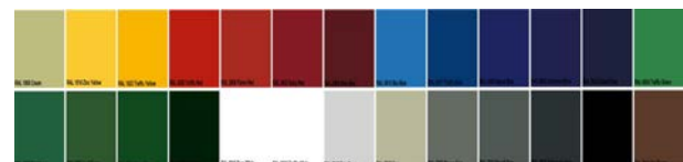
Standard Colour Chart